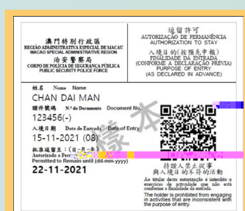
The sample of Authorization to Stay

Tips: Log into WeMust Student APP → Orientation